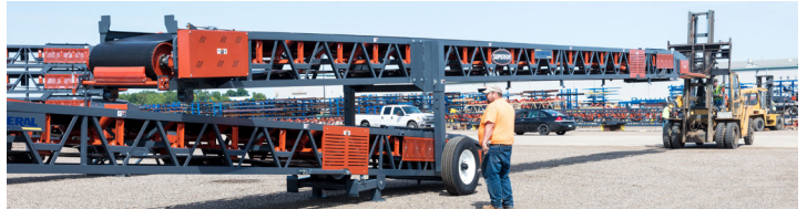
EASILY SLIDE CONVEYORS ON AND OFF