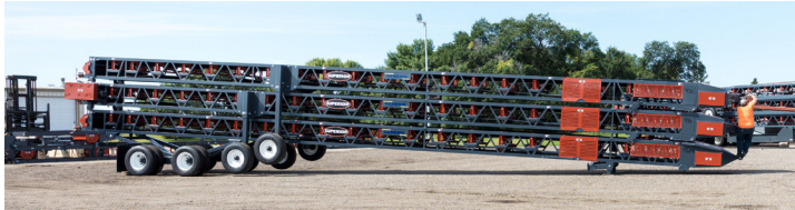
3 TRANSFER CONVEYORS IN A SINGLE LOAD