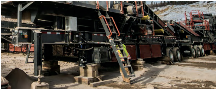
STEEP ANGLE STAIRS