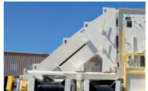
STATIC, MANUAL OR HYDRAULIC CHUTE

Anthem® Inclined Screen Plant information available upon request or visit superior-ind.com/portable-plants