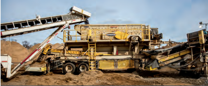
SINGLE SCREEN PLANT