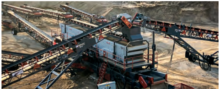
TANDEM SCREEN PLANT