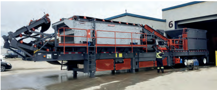
FEEDER SCREEN PLANT