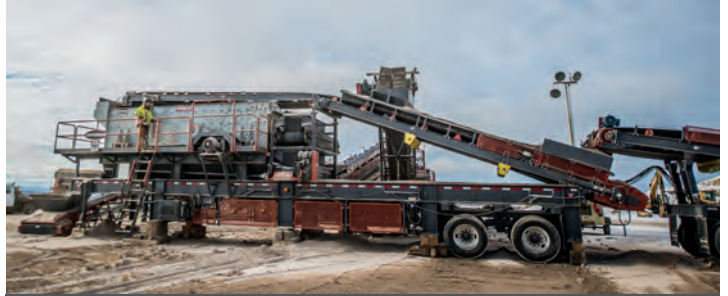
SINGLE SCREEN PLANT W/ OVERHEAD FEED CONVEYOR