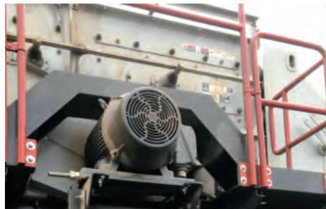
HYDRAULIC FOLD MOTOR MOUNT