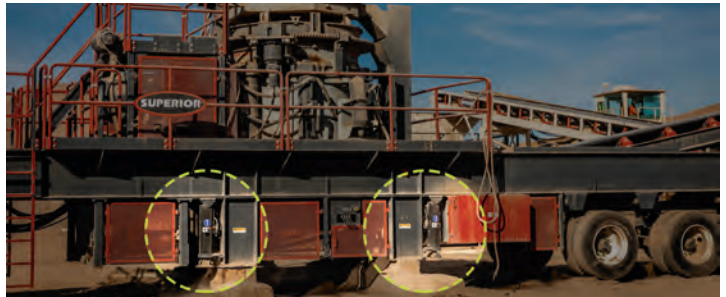
HYDRAULIC RUN-ON LEGS